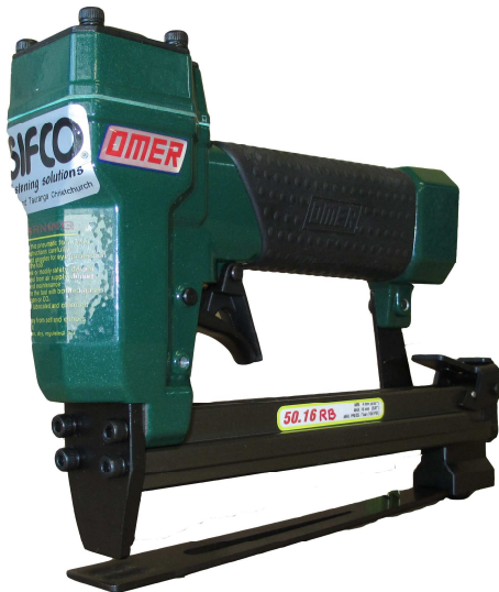
Complete with tools and oil bottle